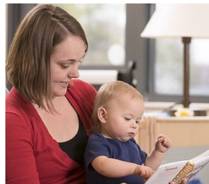
Housing Services Responding to the housing shortage in the area