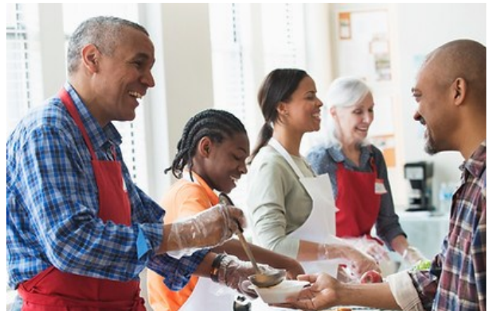
Congregational Outreach, Advocacy, and Organizing