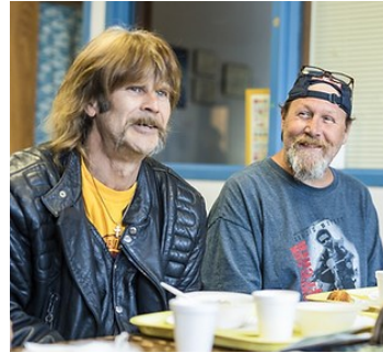
Stabilization Services Helping those in Crisis transition