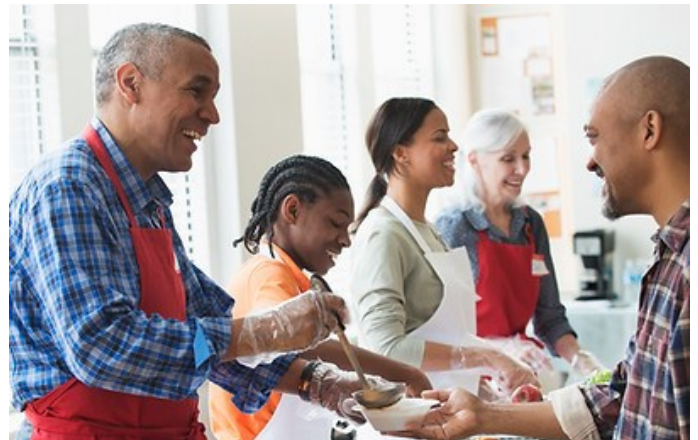
Congregational Outreach, Advocacy, and Organizing